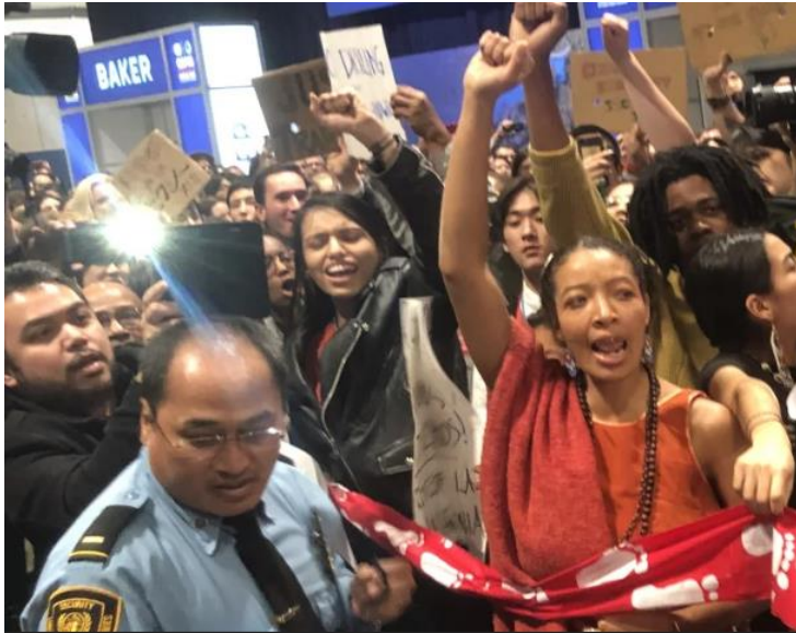
Observers demonstrating outside main negotiating halls

Carbon markets considered an empty capitalist promise by those advocating for nature-based solutions, value of indigenous knowledge